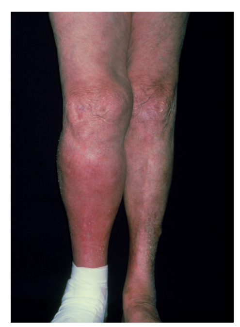
Fig 1 Deep vein thrombosis in the right leg of a patient, with leg swelling and erythema visible